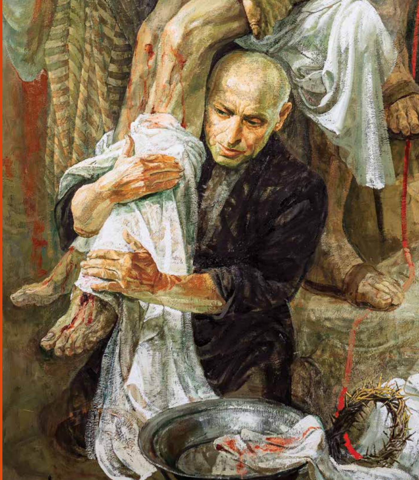
Detail from Deposition by Safet Zec, in the Church of the Gesù in Rome.

This detail focuses on Pedro Arrupe SJ, one of the three figures in that painting: Joseph Pignatelli SJ (1737-1811), Jan Roothan SJ (1785-1853) and Pedro Arrupe SJ (1907-1991).